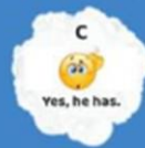
Unit 5 - Has she/he got...? - ...