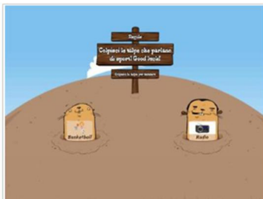
Unit 5 - Sport - MRoberta - 3...