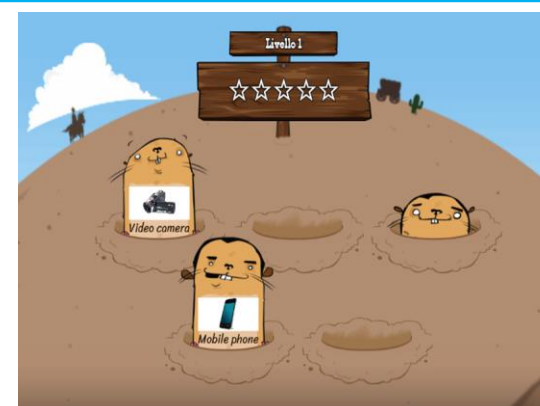
Fun things – Unit 4 - MRoberta