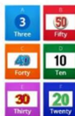
Unit 4 - Numbers_How many...